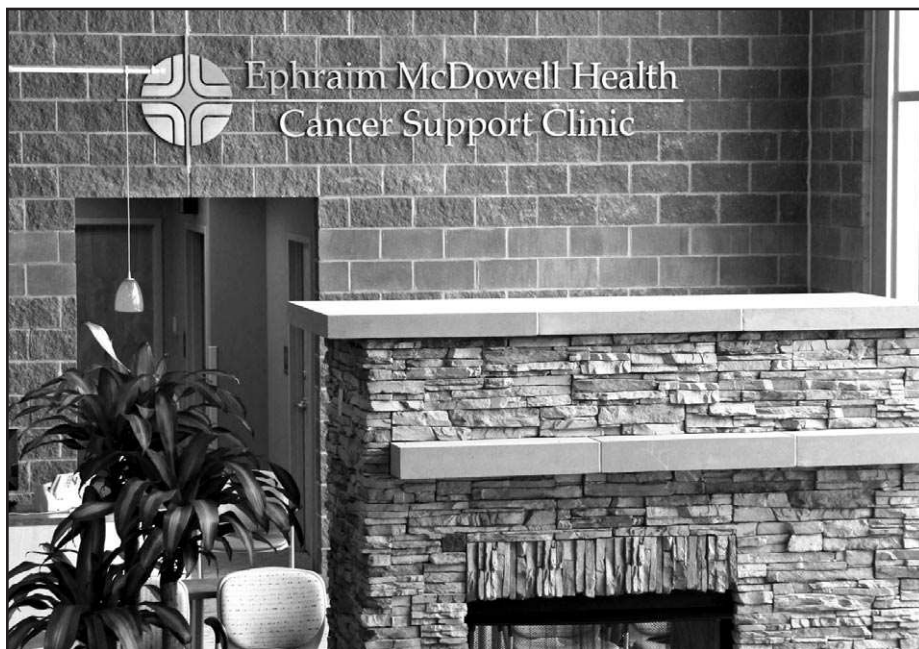
The interior of the building features exposed natural stone that is native to this area.

“The intention is to provide our patients with a comfortable and relaxing environment,” Allen added. “When they’re sitting in a treatment area, surrounded by windows and a beautiful view, we want them to experience a seamless transition from where the outside stops and inside starts – that’s the whole concept of this building.”