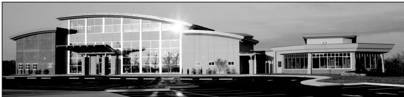
The Central Kentucky Cancer Center opened in June on the South Danville Bypass.

The road to receiving state-of-the-art, highly-specialized cancer care just got shorter. And much more dynamic.